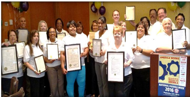
2016 First Place Winner: Atlanta Chapter