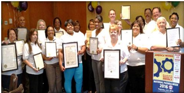
2016 First Place Winner: Atlanta Chapter

Please submit entries in a word document or PDF file.