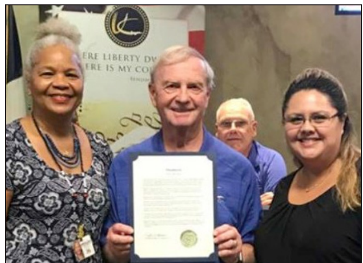
2017 First Place Winner: Alamo Chapter

Please submit entries in a Word document or PDF file. Submit all files to Chapter Relations at chapterrelations@americanpayroll.org .