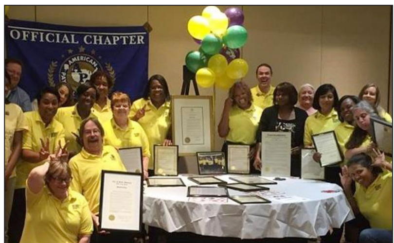
2017 First Place Winner: Atlanta Chapter