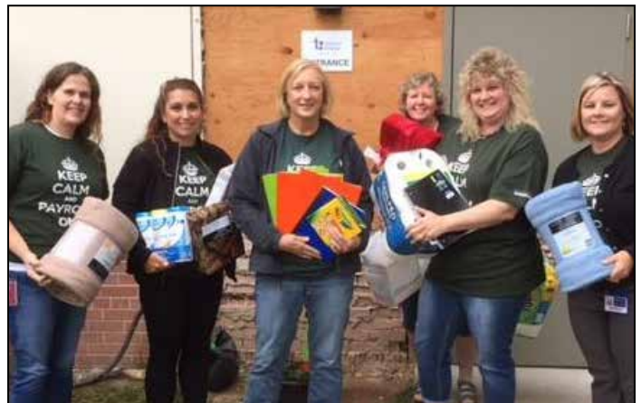
2018 First Place Winner: Northeast Wisconsin Chapter