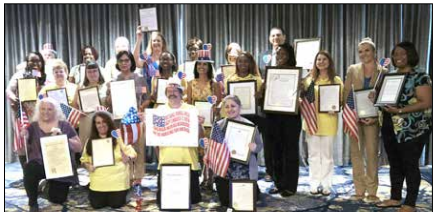
2018 First Place Winner: Atlanta Chapter

Please submit photos in JPEG or PNG format and descriptions in a Word document or PDF file. Submit all files to Chapter Relations at chapterrelations@americanpayroll.org .