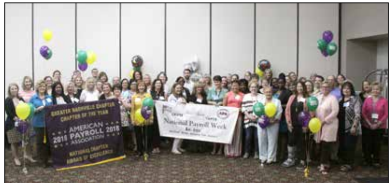
2018 First Place Winner: Greater Nashville Chapter

Please submit entries in a Word document or PDF file. Submit all files to Chapter Relations at chapterrelations@americanpayroll.org .